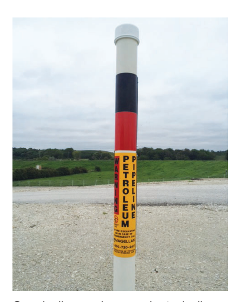
Our pipeline markers can be typically identified by the black and red bands at the top.

Magellan Midstream Partners, L.P., a wholly owned subsidiary of ONEOK, Inc., is a publicly traded limited partnership, principally engaged in the transportation, storage and distribution of refined products and crude oil. Magellan operates a 9,800 mile refined products pipeline system with 54 connected terminals and two marine terminals (one of which is owned through joint venture) and a 2,200 mile crude oil pipeline system.